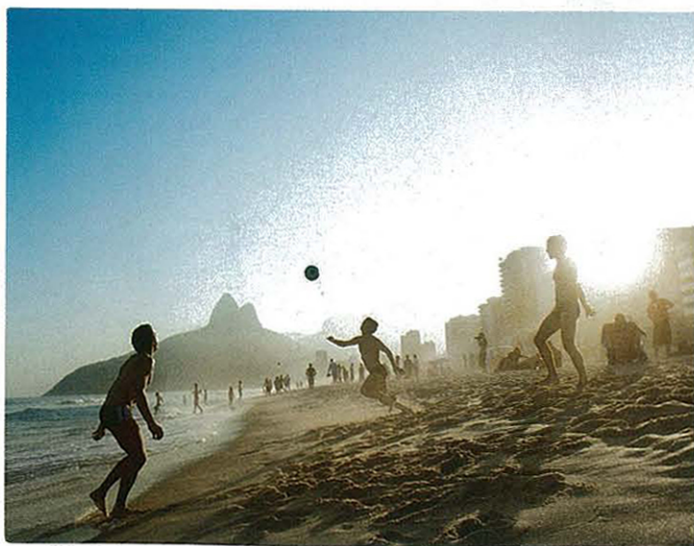
A sunset soccer match on one of Rio's pet-friendly beaches.

YOU MIGHT ALSO CONSIDER Rio de Janeiro, where Brazil's famed