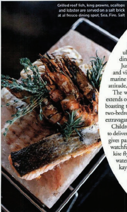
Grilled reef fish, king prawns, scallops and lobster are served on a salt brick at al fresco dining spot, Sea Fire. Salt