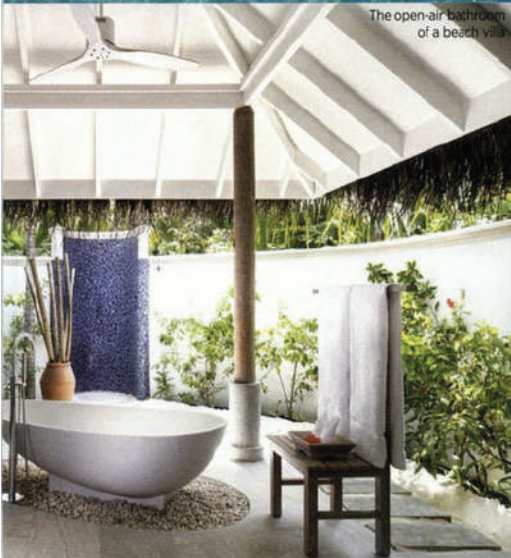
The open-air bathroom of a beach villa

The entire family will enjoy sunset movie nights on the beach