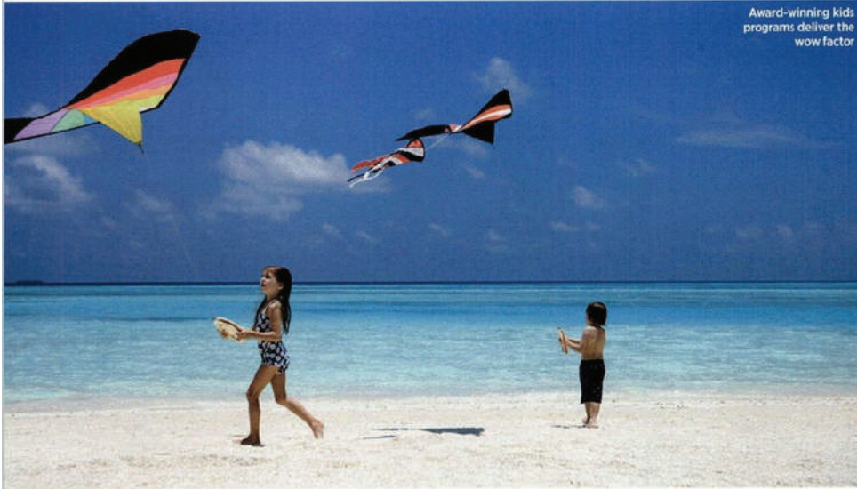
Award-winning kids programs deliver the wow factor