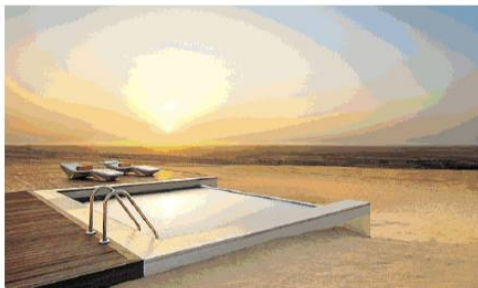
Clockwise from main: Drifting in the pristine waters of Indonesia's Bawah Reserve might float your boat; Portree in Scotland; Turtle Island, Fiji; Raffles Maldives Meradhoo.

excellent cuisine. There are plenty of people who think it's insane to pay to eat at a fine-dining restaurant, and crazy to travel to a country just to eat the food. But it's all about priorities, and doing what makes you happy.