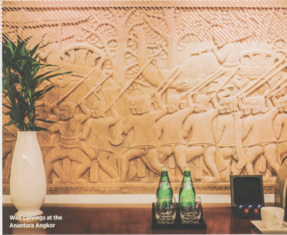
Wall carvings at the Anantara Angkor