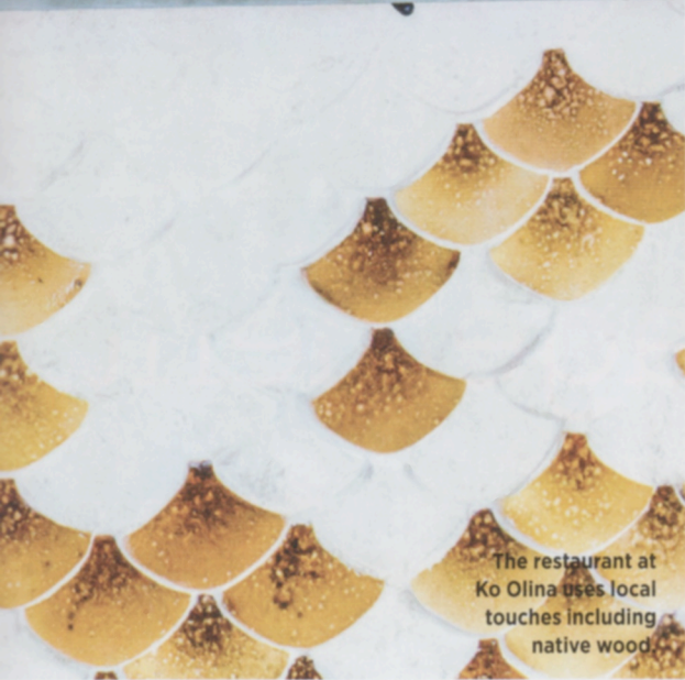
The restaurant at Ko Olina uses local touches including native wood