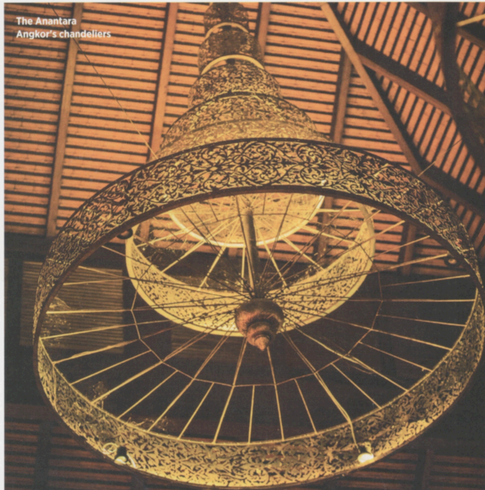
The Anantara Angkor's chandeliers

property – the people, the stories, the geography and the history.”