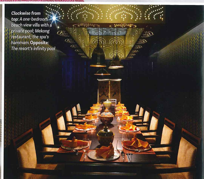
Clockwise from top: A one-bedroom beach view villa with a private pool; Mekong restaurant; the spa's hammam. Opposite: The resort's infinity pool